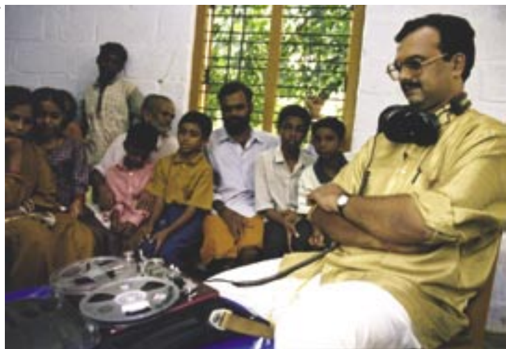
The radio soap opera Tinka Tinka Sukh being tested on an audience in Kerala, India