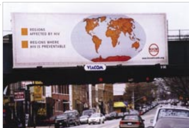
Billboard from KNOW HIV/AIDS campaign

Over the past three years, and in particular since the adoption by all members of the United Nations of a Declaration of Commitment on HIV/AIDS in 2001, a new momentum has resulted in greatly increased resources and renewed political commitment to fight the epidemic. However, efforts still fall far short of what is needed and much remains to be done to reach the United Nations Millennium Development Goal of halting and beginning to reverse the spread of HIV by 2015.