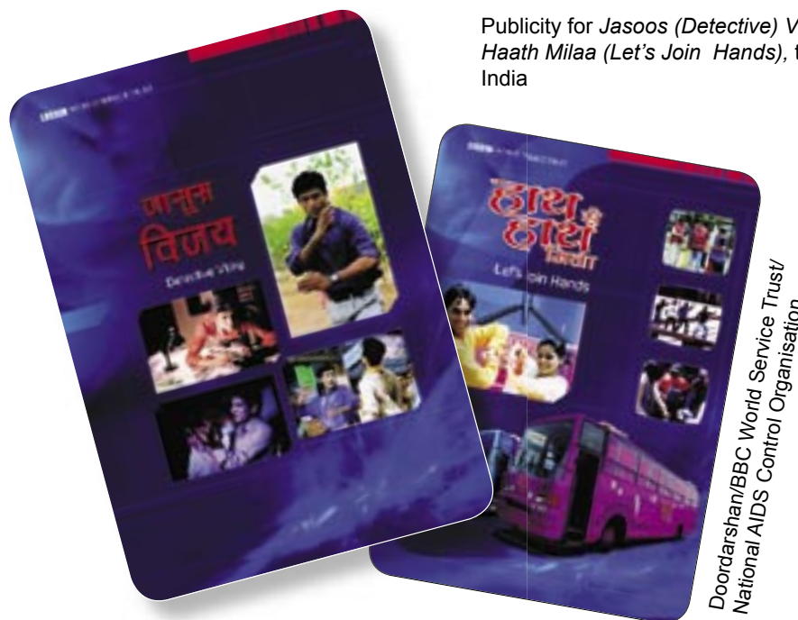
Publicity for Jasoos (Detective) Vijay and Haath se Haath Milaa (Let's Join Hands) , television serials, India

In India, Doordarshan, the national television service, the National AIDS Control Organisation (NACO) and the BBC World Service Trust, (the international development arm of the British Broadcasting Corporation), joined forces in 2002 to launch the country's first-ever mass media campaign to increase awareness of HIV/AIDS. The campaign has been largely based on education through entertainment, with two key strands being the popular interactive detective series Jasoos (Detective) Vijay and the award-winning weekly 'reality' youth show, Haath se Haath Milaa (Let's Join Hands) .