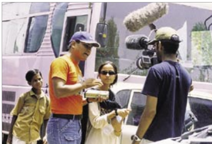
Doordarshan/BBC World Service Trust/ National AIDS Control Organisation

Filming Haath se Haath Milaa , youth programme, India