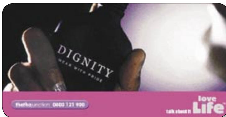
Campaign material targeting youth, South Africa

development of youth friendly services and support programmes countrywide. loveLife is able to greatly extend the scale and scope of its media campaign through cost-sharing partnerships with key media organizations. The South African Broadcasting Corporation is loveLife’s broadcast