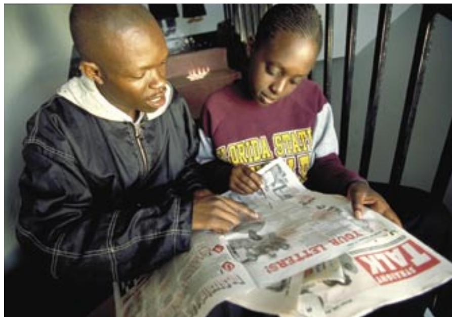
Young people reading Straight Talk , a youth newspaper, Kenya