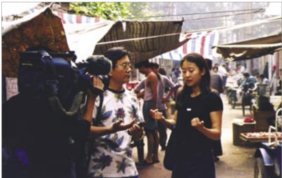
Shooting of Bai Xing soap opera, CCTV, China