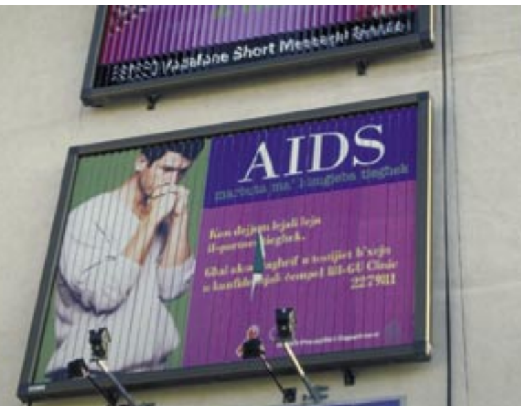
Billboard produced by the Health Promotion Department, Malta