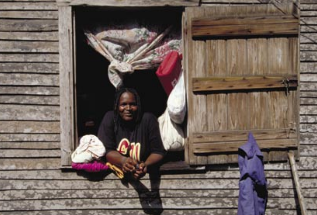
Women are especially vulnerable to HIV/AIDS

partners and fear of violence if they refuse sex. Rape is also often a reality. Nearly 50% of young women in 9 Caribbean countries have said that their first sexual intercourse was forced.