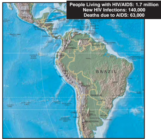
Figure 1: Snapshot of the HIV/AIDS Epidemic in Latin America, 2007 1