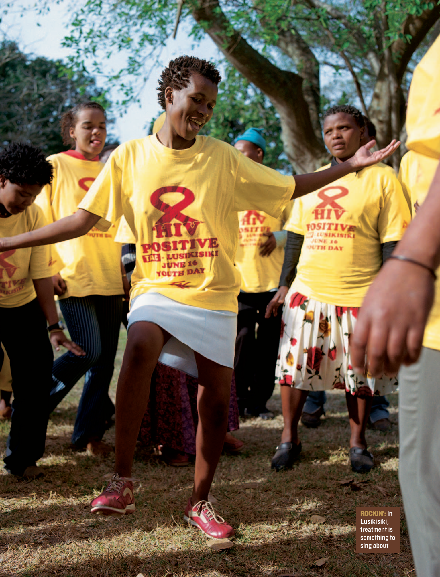
ROCKIN': In Lusikisiki, treatment is something to sing about